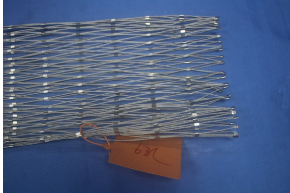
After test -2